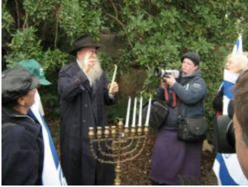
Those who have led others to believe the temple mount can't be shared will not be in major positions of influence in Jerusalem

them. The wall in between their sanctuaries, guarded by police, will keep them from fighting and from even seeing each other. There will even be separate entrances to prevent them from crossing paths.