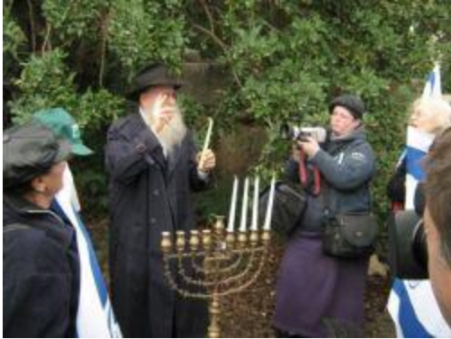
Those who have led others to believe the temple mount can't be shared will not be in major positions of influence in Jerusalem

This represents a better approach to the issue. Both sides will be able to freely worship in their holy sanctuary on the holy mount and an impartial police will maintain peace between them. The wall in between their sanctuaries, guarded by police, will keep them from fighting and from even seeing each other. There will even be separate entrances to prevent them from crossing paths. (Hawkins, 2012) The leaders who have been leading their people to believe that they