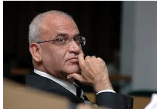
Saeb Erekat, taken from the 2009 negotiations:

The first example of a peaceful solution to the temple mount problem was suggested by Saeb Erekat, the chief negotiator of the Palestinian Authority, in a 2009 conference with George Mitchell, the US Middle East envoy, David Hale, Mitchell's deputy, and Jonathan Schwartz, the then-U.S. State Department legal adviser. At this conference, Erekat suggested that control of the temple mount be given over to a United Nations committee and that the Clinton Parameters formula be instituted. The Clinton Parameters formula, as pertaining to the temple mount, states that Israel would receive sovereignty over the Western Wall and that Israel would gain "symbolic ownership" of the temple mount with both sides sharing power over the issue of excavation under the temple mount. (Swisher, 2011) The problem with this solution is that it does not entirely address the issue. The Jews are still left without their temple, which is the main problem. This solution would only create larger problems because angry protests and demonstrations would escalate due to the fact that a deal was made regarding the temple mount that did not end with them getting what they want. This would start armed conflict in the area which could potentially involve much of the region and the world.