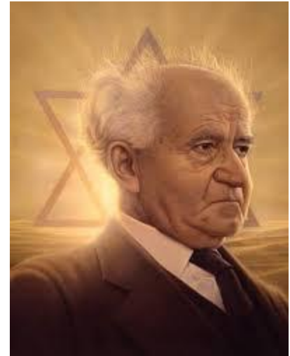
David Ben-Gurion became the first President of Israel

During the World War II, many Jews were employed in the British army where they were trained how to fight. At the end of World War II, in direct response to the horrors of the holocaust and threats by Palestinians to eradicate all of Judaism, the United Nations supported the Jews return to their homeland. As many Jews started migrating back to their homeland (Israel) as part of the Zionist movement, they started moving in next to their mostly Muslim neighbors and began banding together to form their own country without the consent of the Muslims already living there. They even, under David Ben-Gurion, started an underground army using weapons and training they got from