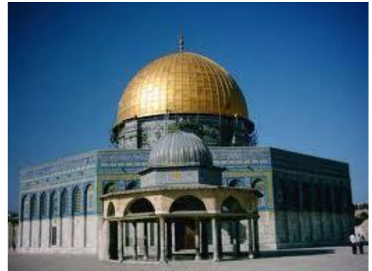
The Dome of the Rock

Islam came off the victor. The Dome of the Rock mosque was built to enshrine Haram as-Sharif, the Noble Sanctuary, which is the rock that Muhammad ascended into heaven on. It is also where Muhammad's tomb is. The mosque was also built with the intent of re-orienting Muslim prayers and pilgrimage back to Jerusalem. This was because Chaliph Abd El-Malik became concerned that the people under his rule would be influenced by his political rivals as they journeyed to Mecca, where his rival ruled. (Dome of the Rock, 2013)