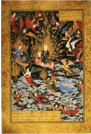
The Night Journey

other prophets and ascends into heaven to visit God. Originally, Muhammad told his followers to pray towards Jerusalem and make their pilgrimage there, not Mecca. It was later changed to Mecca in order to distinguish Muslims from other monotheistic religions.