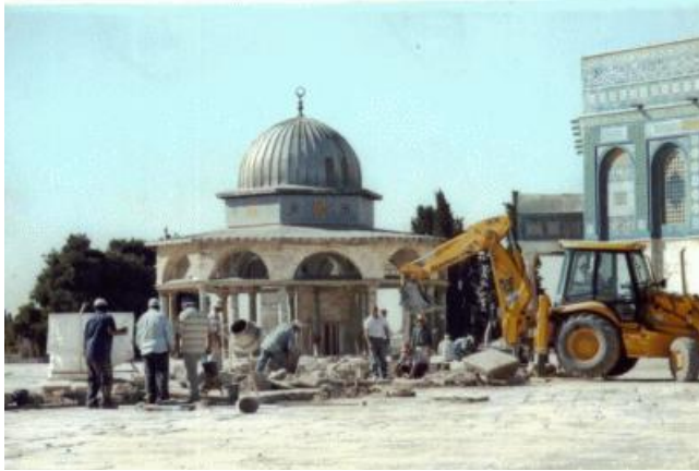
Leaders of the mosque have authorized excavations on the temple mount to make room for more worshippers

Since the Dome of the Rock is such a sacred site in Islam, it is natural that there would be many pilgrims and tourists that go there. Unfortunately, there simply isn't room for as many people as would like to be there. Because of this, the leaders of the mosque have been excavating under and around the mosque to make room for more worshippers.