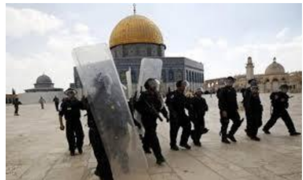
Many demonstrations and riots have had to be broken up by police already

One: who does this problem affect and how? The more people that the problem affects, the worse the problem is. How these people are being affected is an important factor. Are they affected monetarily, or is the issue threatening their lives, homes, or families? This problem has the potential to affect everyone in the world to some degree. It most directly affects all of the countries in the Middle East, beginning with Israel. This affects the citizens of Jerusalem because of the demonstrations and protests that have to be broken up by police. This affects all countries