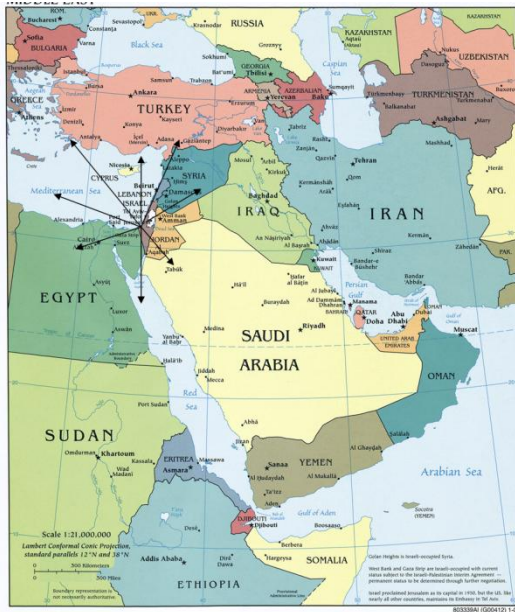
This problem could potentially spread throughout the whole world

doesn't affect them very much, so according to the first criteria, this is not yet an unmanageable problem though it does have the potential to be.