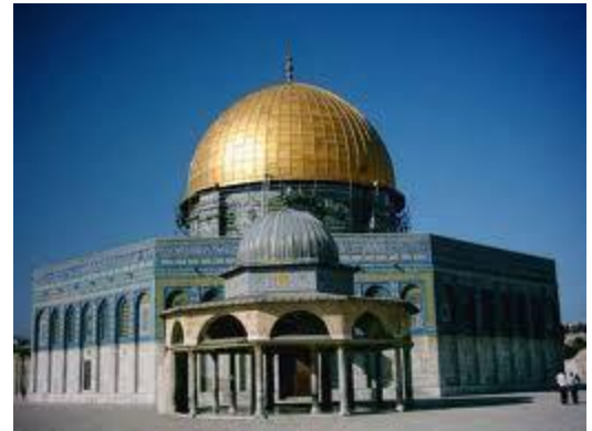
The Dome of the Rock

Islam came off the victor. The Dome of the Rock mosque was built to enshrine Haram as-Sharif, the Noble Sanctuary, which is the rock that Muhammad ascended into heaven on. It is also where Muhammad's tomb is. The mosque was also built with the intent of re-orienting Muslim prayers and pilgrimage back to Jerusalem. This was because Chaliph Abd El-Malik became concerned that the people under his rule would be influenced by his political rivals as they journeyed to Mecca, where his rivals ruled.