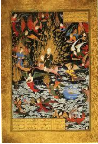
The Night Journey

other prophets and ascends into heaven to visit God. Originally, Muhammad told his followers to pray towards Jerusalem and make their pilgrimage there, not Mecca. It was later changed to Mecca in order to distinguish Muslims from other monotheistic religions.