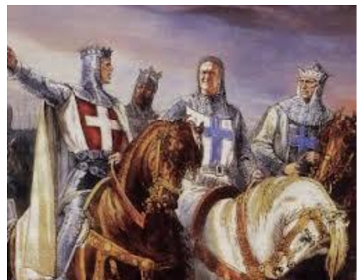
Control of the temple mount shifted with nearly every crusade.

Control of the temple mount, and all of Jerusalem shifted between Christianity and Islam many times since the Dome of the Rock was built, but the mosque was never destroyed. Many crusaders thought that the mosque was Solomon’s temple, and they merely converted it into a church rather than destroy it. Thus, they left it intact for when Jerusalem was retaken again by the Muslims. The crusades ended with the Muslims in control of the temple mount. Islamic countries were in control of the holy land from the last