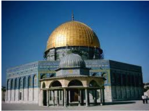
The Dome of the Rock

prophet Muhammad was taken in a vision known as the night journey. In this legendary journey, Muhammad travels to “the farthest mosque”, Jerusalem, and there he worships with other prophets and ascends into heaven to visit God. Originally, Muhammad told his followers to pray towards Jerusalem and make their pilgrimage there, not Mecca. It was later changed to Mecca in order to distinguish Muslims from other monotheistic religions.